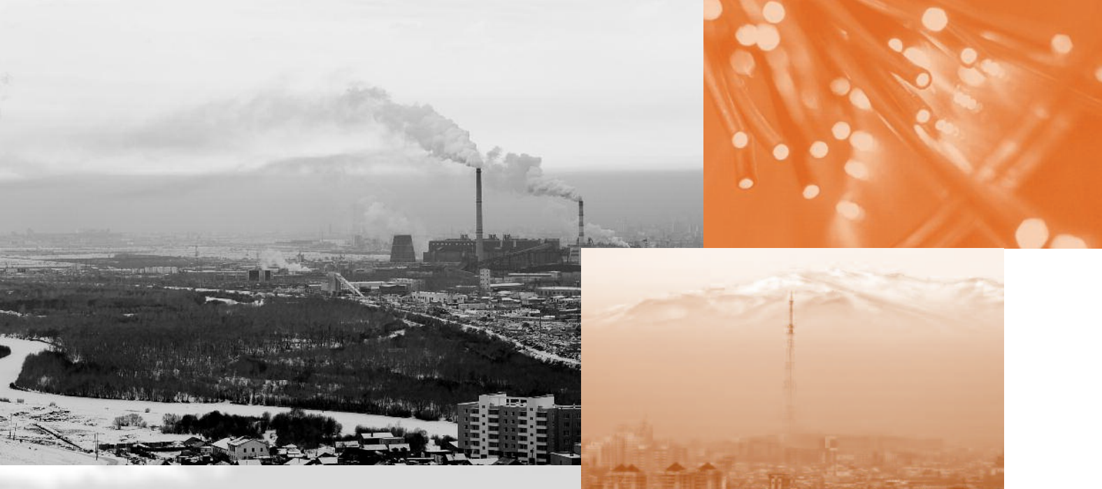
Air pollution in the Mongolian capital Ulaanbataar often cloaks the city in an unhealthy white haze.

from different nations together to help developing countries increase their utilization of science and technology (S&T).