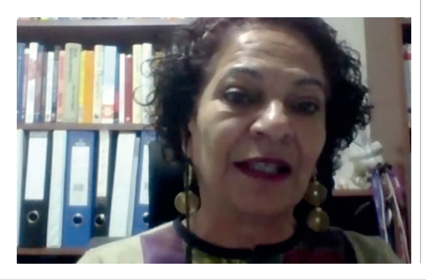
See the full session here: https://youtu.be/IMX0ZG3GJr0