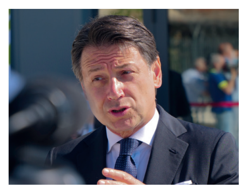
▲ Italian President of the Council of Ministers Giuseppe Conte speaks with the press outside ESOF 2020 after arriving.