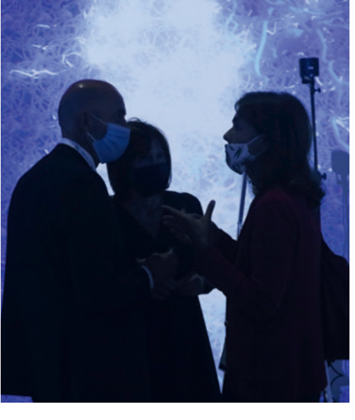
▲ The CYBORN exhibit at ESOF 2020.