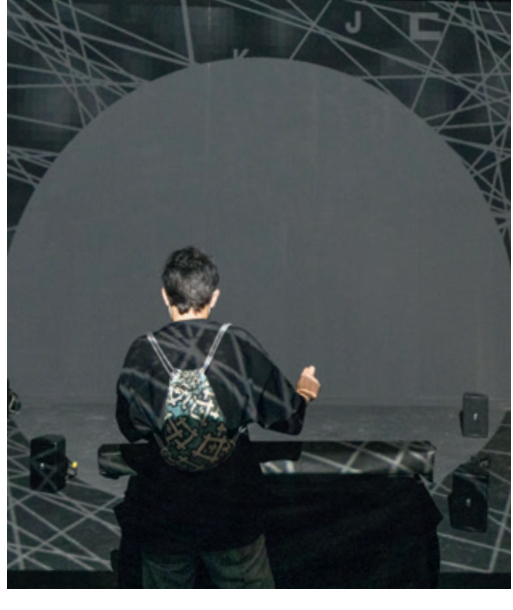
▼ The main stage at ESOF 2020.